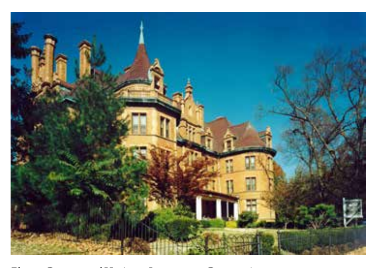
Located in the Mt. Airy neighborhood of Philadelphia, the 1895 Nugent Home for Baptists was originally built as a retirement home for Baptist ministers.

To understand the complexities of combining the two programs, it is important to understand the basics of each program. The HTC provides a 20 percent "by-right" tax credit based on qualified rehabilitation expenditures. To be eligible for the HTC, a building must be a qualified historic